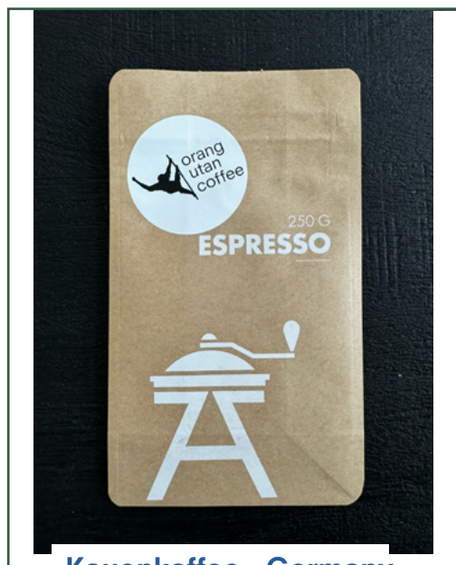
Kauenkaffee - Germany