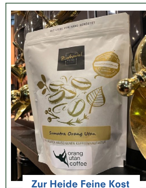
Zur Heide Feine Kost Germany