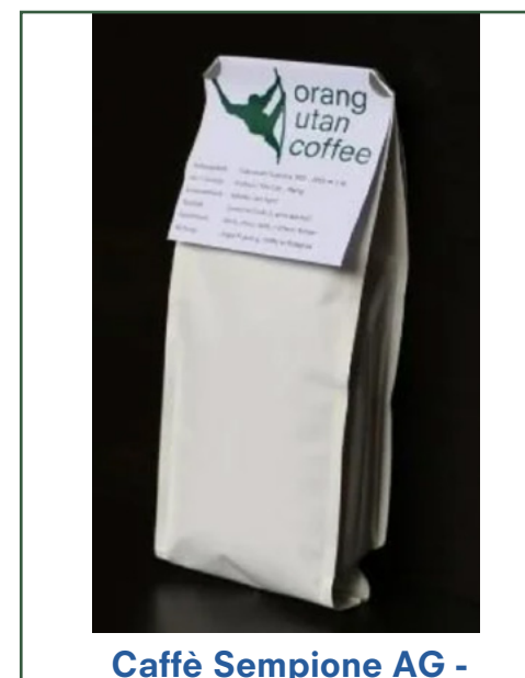
Caffè Sempione AG - Switzerland