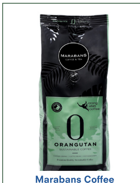
Marabans Coffee & Tea - Spain