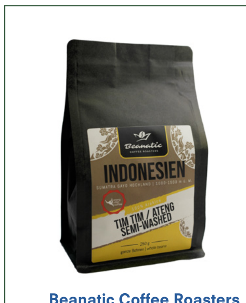
Beanatic Coffee Roasters - Switzerland