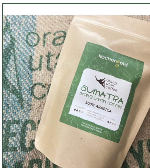
Kocher Gold - Germany