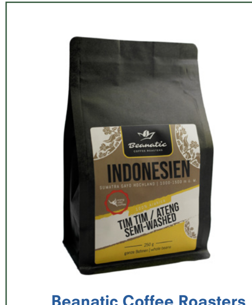
Beanatic Coffee Roasters - Switzerland