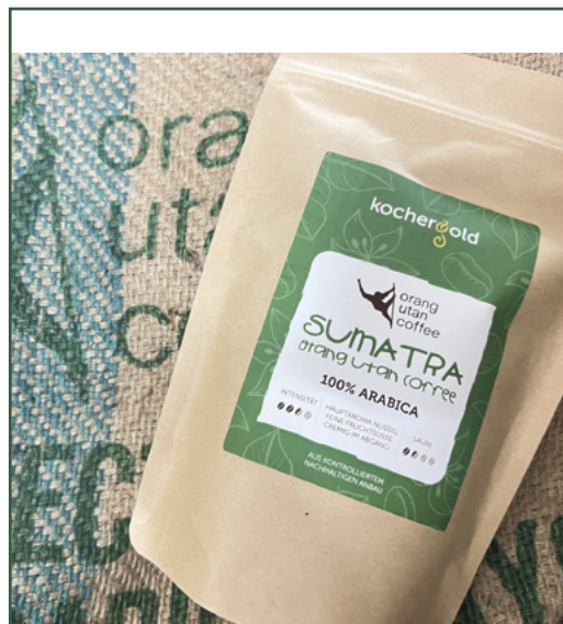
Kocher Gold - Germany