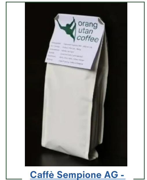
Caffè Sempione AG - Switzerland