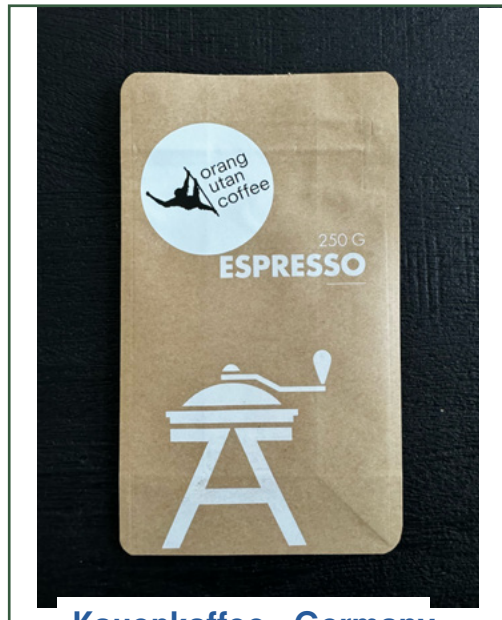
Kauenkaffee - Germany