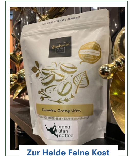
Zur Heide Feine Kost Germany