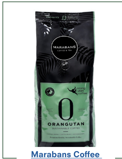
Marabans Coffee & Tea - Spain