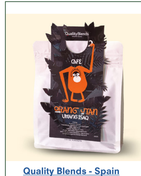
Quality Blends - Spain