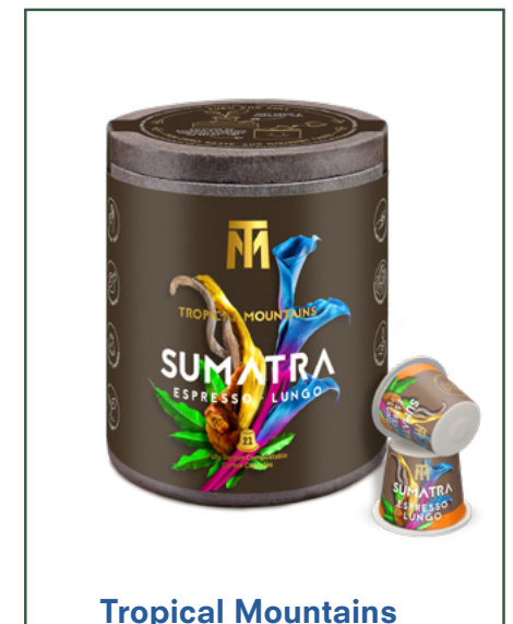
Tropical Mountains - Switzerland